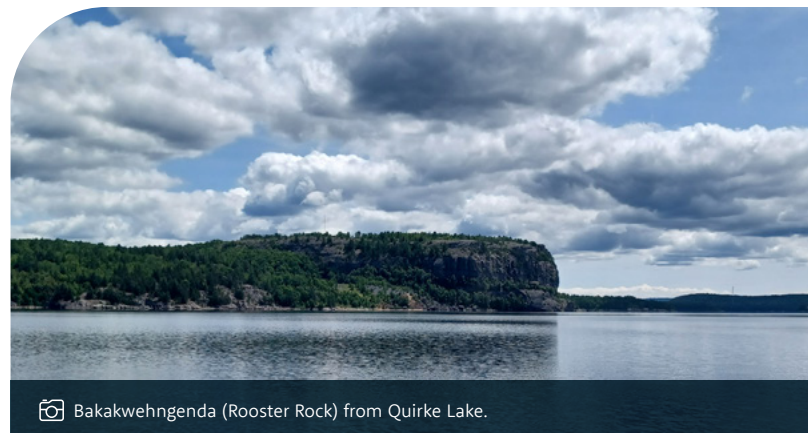
Bakakwehngenda (Rooster Rock) from Quirke Lake.